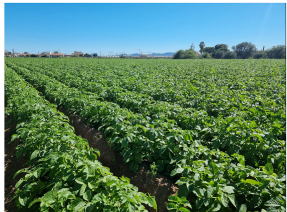
CORINNA in south of Spain

MONIQUE is also in a dynamic phase of development and has reached a significant commercial position with 'chair ferme' listings across French supermarket chains some while ago. Its excellent washability even after long storage makes it particularly attractive. For packers and retailers, this means consistent taste and visual quality at the point of sale – coupled with reliable performance in the field.